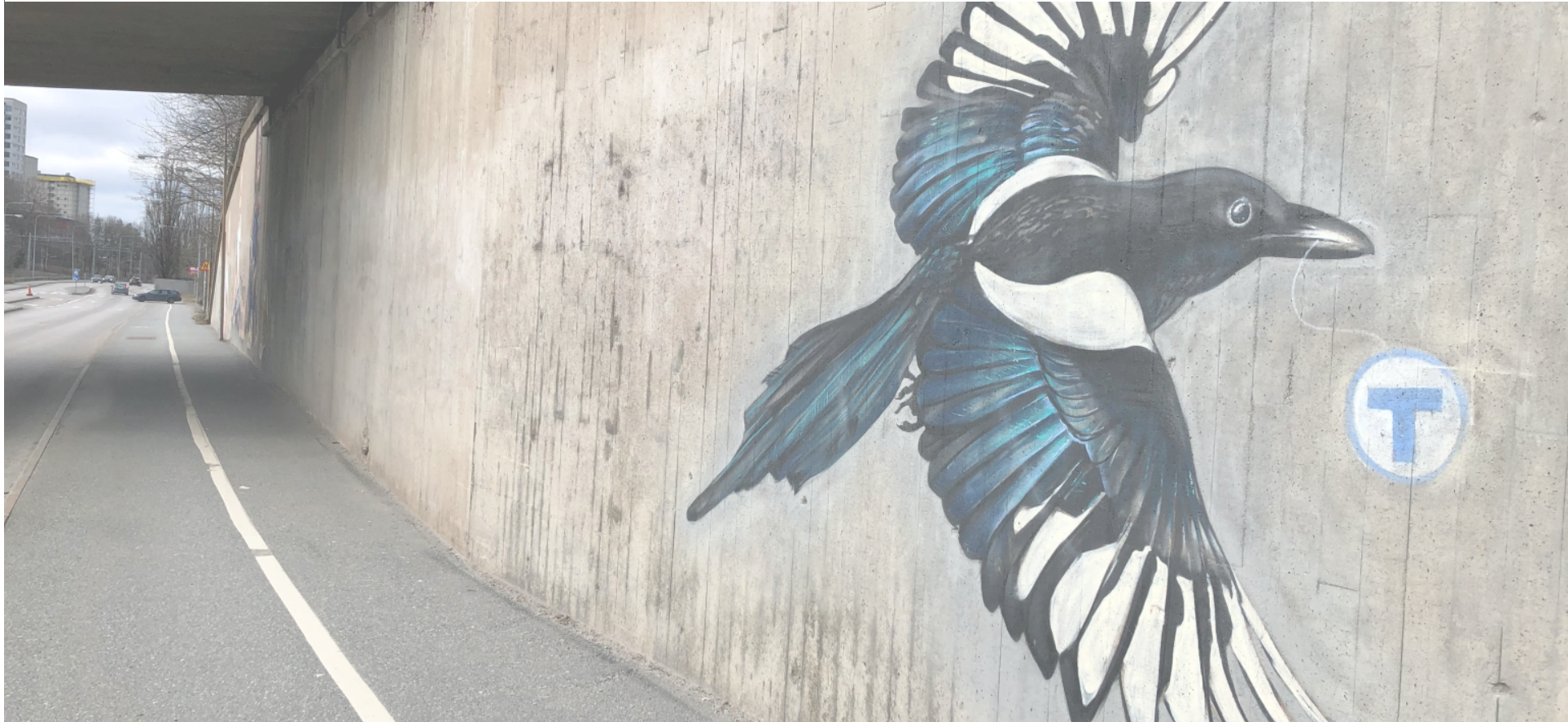
Pia Dahlman Landscape Architecture